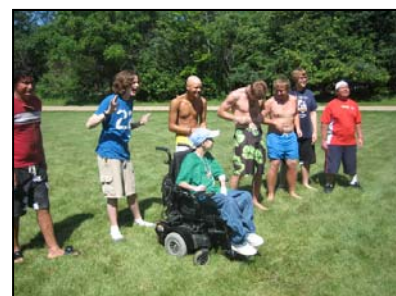
Campers enjoying competitive outdoor games

The most amazing part of today for me was the activities in the after-