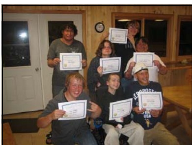
Frost-eh Monk-ehs win the scavenger hunt

The kids arrived late in the afternoon to a standing ovation from the counselors complete with signs for each camper, horn blowing and just an all around celebration!!! The early evening was spent with typical logistics with medicine check-in, bunk assignments and team building. Once we got everyone settled, we had a pizza dinner followed by a short hike down to the lake for some sing-a-long camp songs next to a roaring camp fire. We sang, danced, roasted marshmallows and ate s'mores while dodging the biggest mosquitoes I have ever seen. It was an inspiring evening.