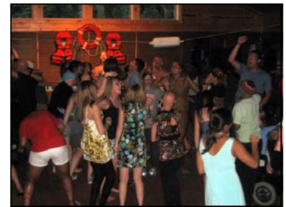
Campers at the Dance